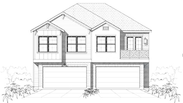
Plan C1 Plan C2 3 beds | 2.5 baths | 1435 sf