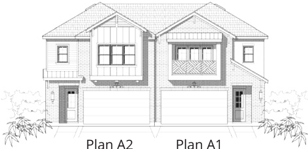
Plan A2 Plan A1 3 beds | 2.5 baths | 1797 sf