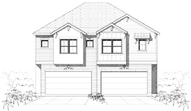
Plan B1 Plan B2 3 beds | 2.5 baths | 1600 sf